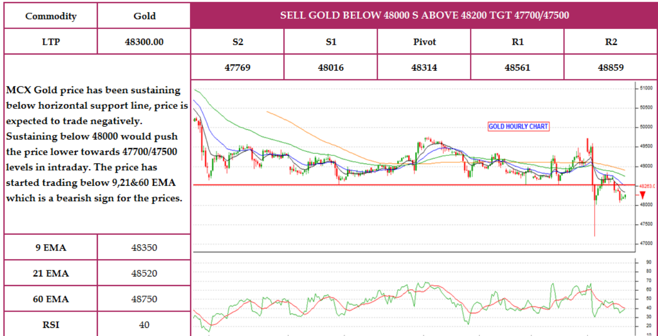
Chart of the days